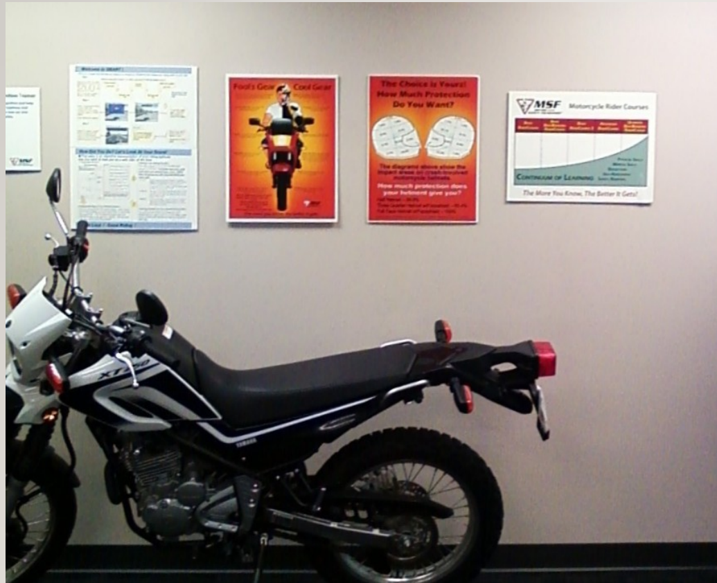
Posters on Classroom Wall